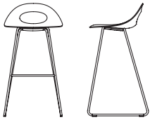
STL30 Poly Shell Sled Frame

COM/Grade A Grade B Grade C Grade D Grade E Grade F Grade G Grade H Leather COL