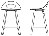
CH24 Poly Shell Wood Legs

3203-CH24-SL 1030 1070 1125 1150 1190 1290 1380 1470 1545 1125