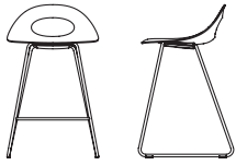
CH24 Poly Shell Sled Frame