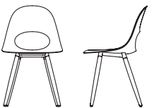
Poly Shell Wood Legs