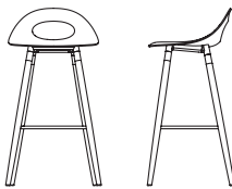
STL30 Poly Shell Wood Legs