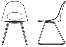
Poly Shell Sled Frame

COM/Grade A Grade B Grade C Grade D Grade E Grade F Grade G Grade H Leather COL