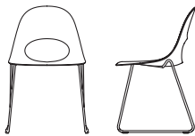
Poly Shell Stacking Sled Frame