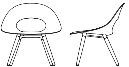
Wood Shell Wood Legs