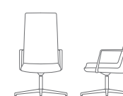
132L defign lounge high back