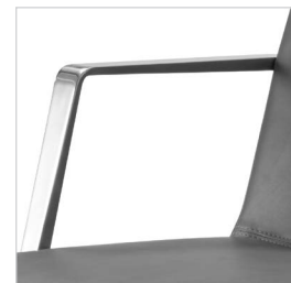
polished aluminum arm