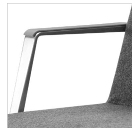
grey poly arm cap