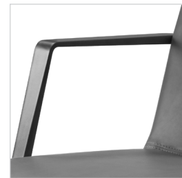
matte black powdercoat arm