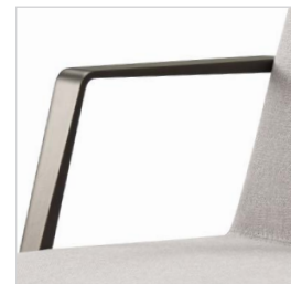
dark bronze powdercoat arm