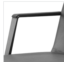
black poly arm cap