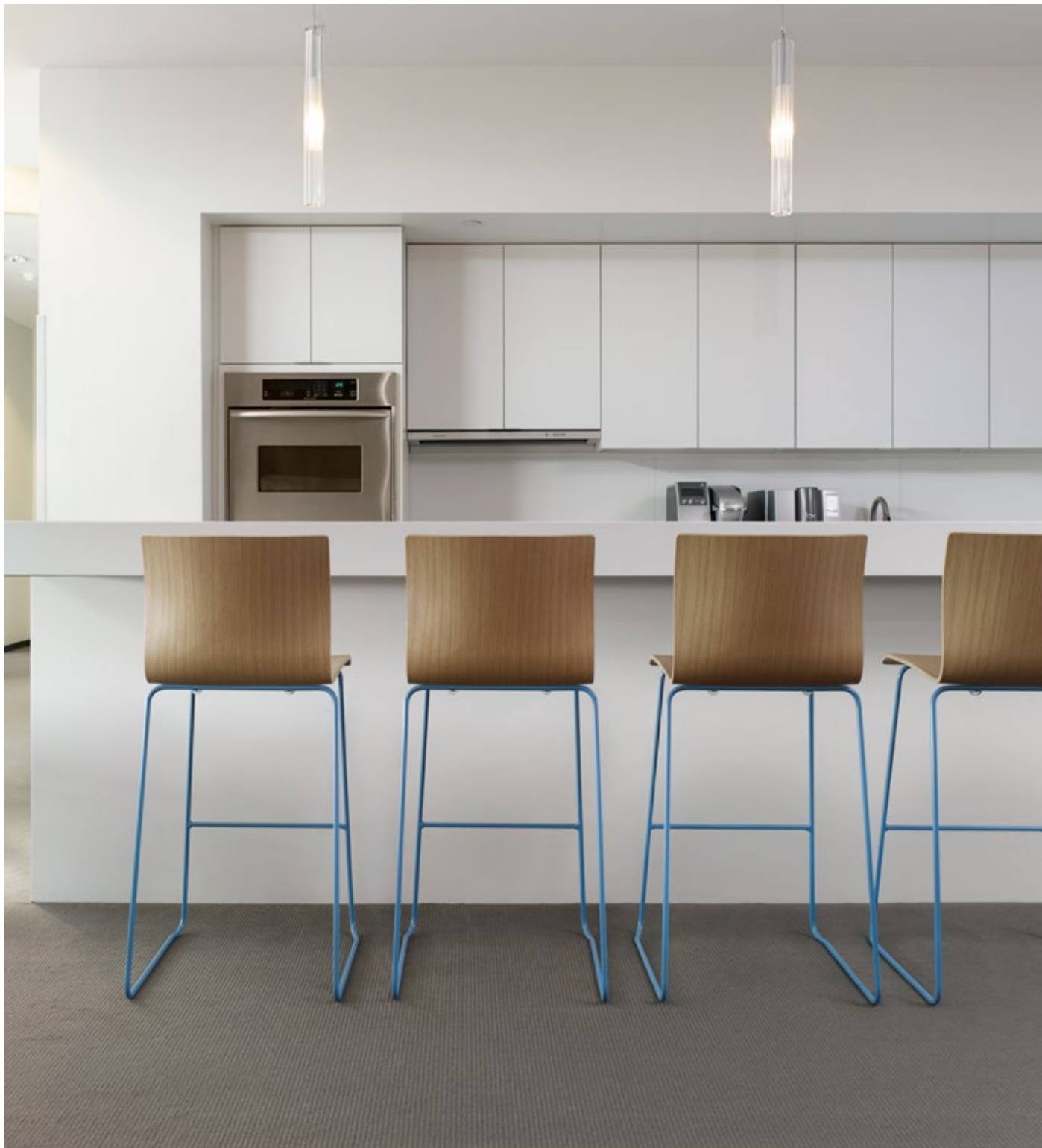
Axis Sled Frame Stool