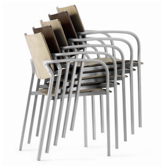
font stacks six high