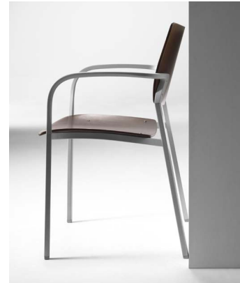
wall saver design